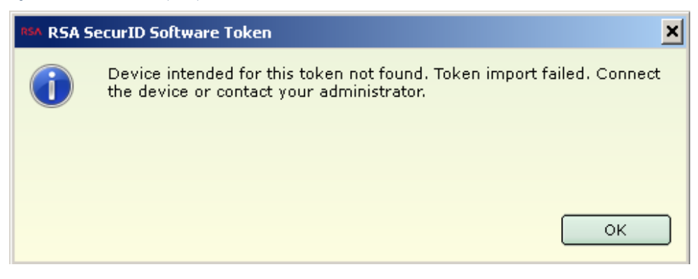
Figure 7 – RSA SecurID error prompt

The software token is generated for a specific system, but of course this system specific value could easily be retrieved by the actor when having access to the system of the victim.