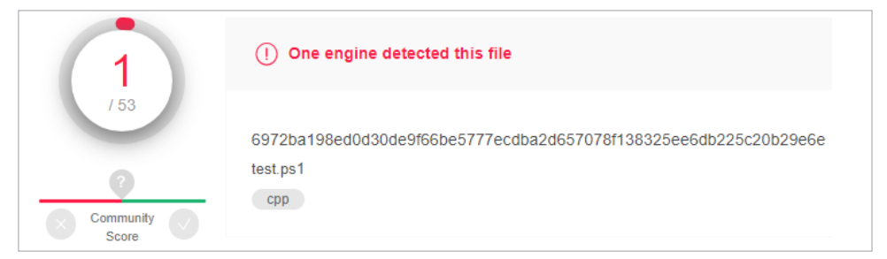
Figure 6 – VirusTotal XServer detection rate

The hashes provided in the table below are for the deobfuscated C# code of the XServer backdoor, as is the version uploaded to VirusTotal.