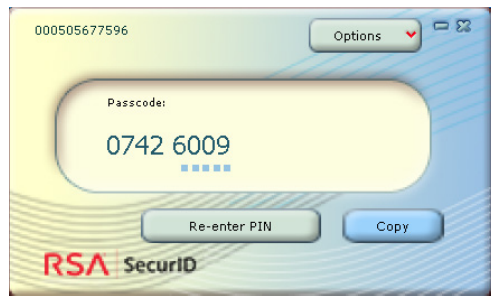
Figure 8 – RSA SecurID generating valid 2 factor codes

In short, all the actor has to do to make use of the 2 factor authentication codes is to steal an RSA SecurID Software Token and to patch 1 instruction, which results in the generation of valid tokens: