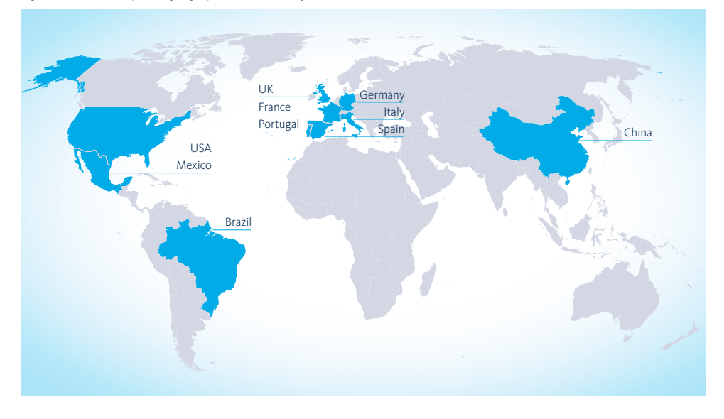
Figure 3 – World map with geographical locations of victims

Fox-IT has identified dozens of victims across the world, including in Brazil, China, France, Germany, Italy, Mexico, Portugal, Spain, United Kingdom and the United States.